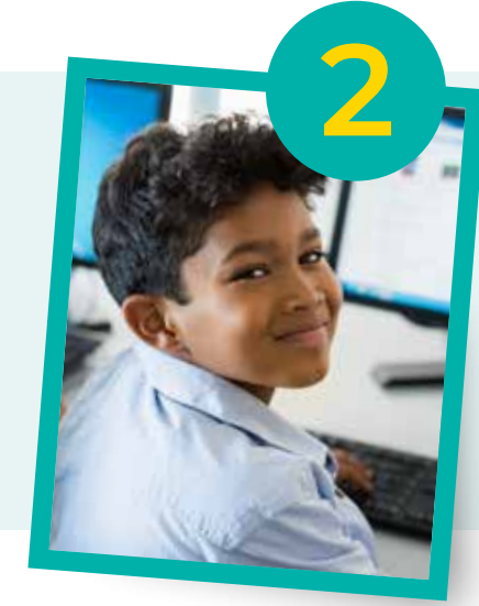
'My school time is my learning time'

We don't want to be taken out of classes for meetings, or have meetings in rooms that are visible to other people