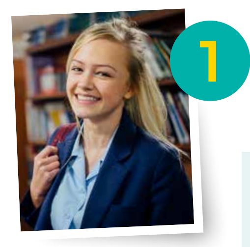
'They say they won't treat us different when they do'

hildren and young people who have been in care tend to gain fewer qualifications and have a less positive time at school. But this doesn't have to be the case - they are aspirational and with the right support they can achieve. Children and young people appreciate the valuable help that they get from teachers, but there are still some things that they think all schools could do to help.