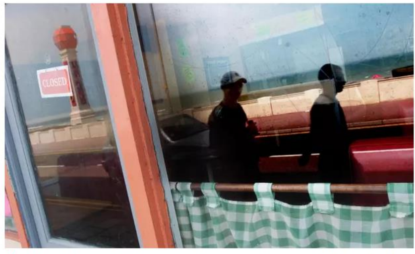
▲ 'Out-of-area placements are a particular issue in Kent. There are currently more than 1,300 looked-after children in the county who have been sent from another local authority.'

Sending children in care to live in deprived parts of Kent is exposing them to gang violence and sexual exploitation