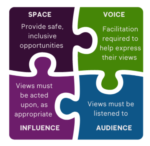
Figure 1: The Scottish Model of Infant Participation based on Article 12 of the United Nations Convention on the Rights of the Child. Adapted from Lundy (2007) and DCYA (2015).

SPACE and VOICE relate to the infant's right to express their views.